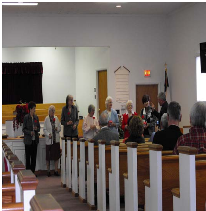
Widows Appreciation Day